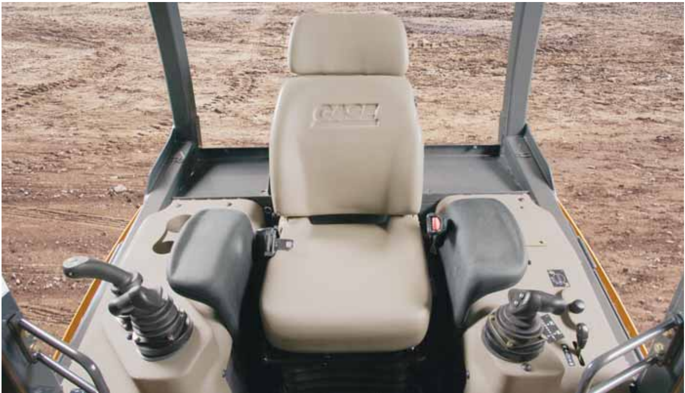
The operator's platform is isolation mounted, providing more comfortable operation.