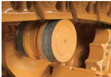
Two track frame-mounted carrier rollers maintain proper track tension.