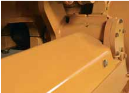
Smooth, tapered track covers provide easy undercarriage cleaning.

The undercarriage on the 1150K is built for precise, stable and low-cost operation. Heavy-duty pins, bushings and rollers provide long-term, hassle-free track life. Pinned equalizer beam suspension provides a smooth ride, stability and maximum traction for work on slopes, stump removal or pushing hard at low speeds – no matter what the conditions are.