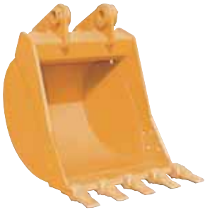
General purpose (STDP)

Buckets tailor the machine to the job and attachments add versatility