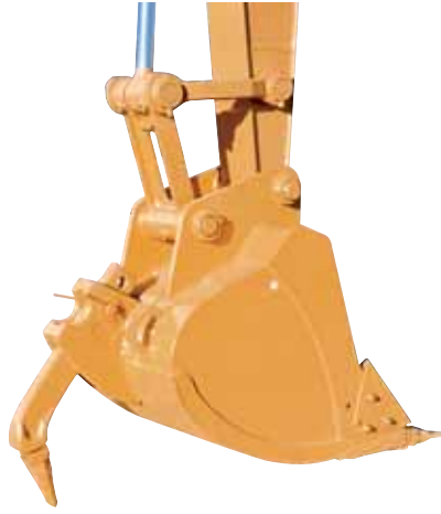
Frost tooth bucket