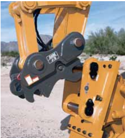
Case/JRB hydraulic slide loc ® coupler

See your local Case dealer for more information on the complete line of buckets and options.